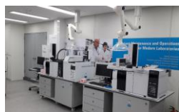
Technology on display