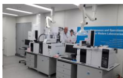
Technology on display